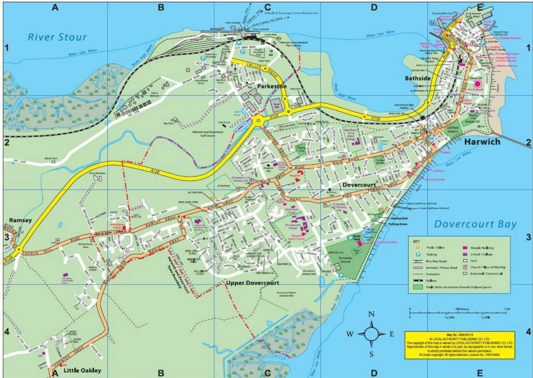
Although our mapping data is sourced from Ordnance Survey's latest data sets, current accuracy cannot be guaranteed at time of press. Should you notice an inaccuracy or omission, please email harwich@localauthoritypublishing.co.uk so that next edition's map is as up to date as possible.